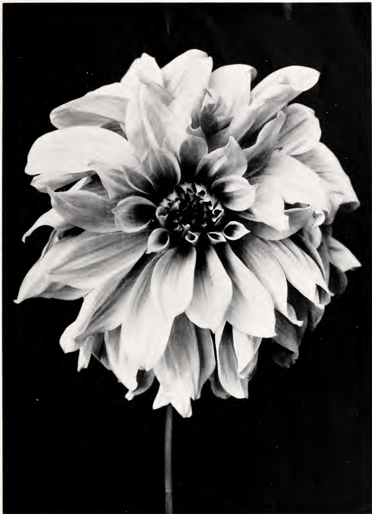
ARTHUR M. HYDE